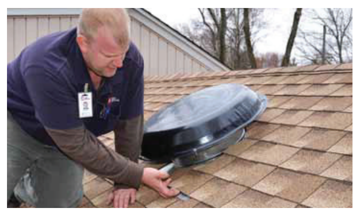
Ensuring attic ventilaton and accessories are installed properly to maximize performance and prevent future leaks