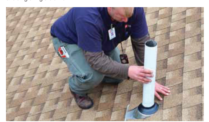
Ensuring flashings are installed properly to protect the roof deck and living space from water damage.